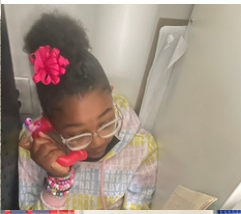
"3rd Grade Field Trip to NCAA Hall of Champions.